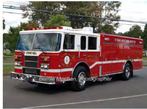
2000 Pierce Mfg. Inc. Saber