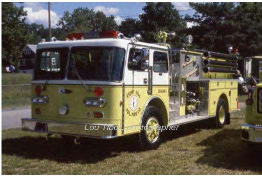
1983 Pierce Mfg. Inc.