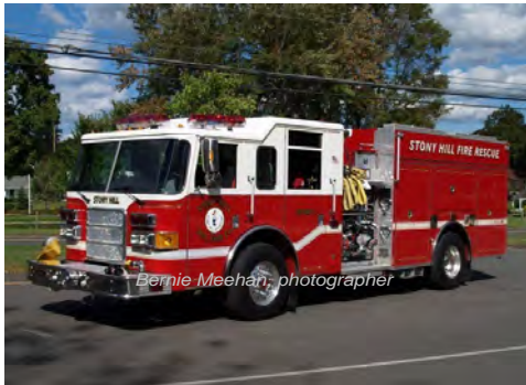
2005 Pierce Mfg. Inc. Enforcer

2000- Stony Hill Fire Dept., Bethel Rescue 2