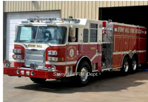
2013 Pierce Mfg. Inc. Arrow XT