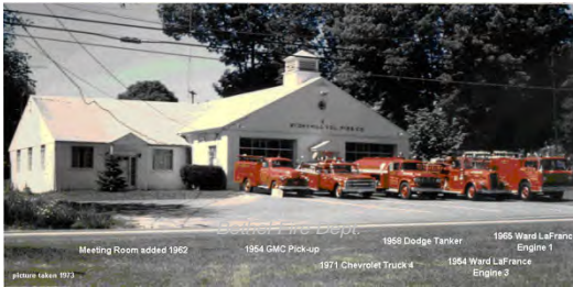
Meeting Room added 1962 1954 GMC Pick-up 1971 Chevrolet Truck 4 1968 Dodge Tanker 1965 Ward LaFrance Engine 1 1964 Ward LaFrance Engine 2 picture taken 2013