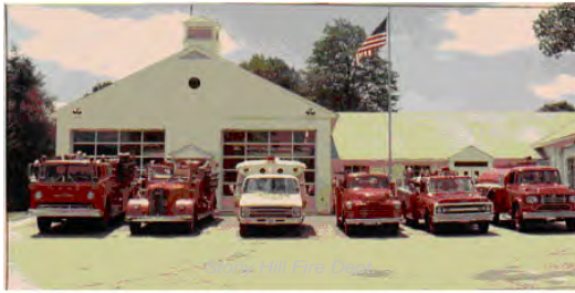
Completed 1975 Building Expansion 1st Ambulance - 1975 Dodge