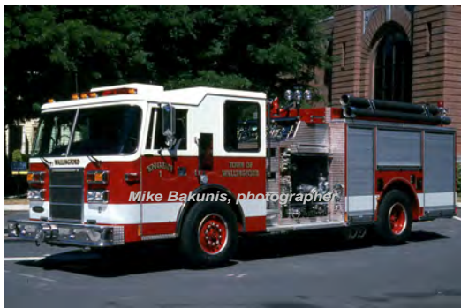
1995 Pierce Mfg. Inc. Dash