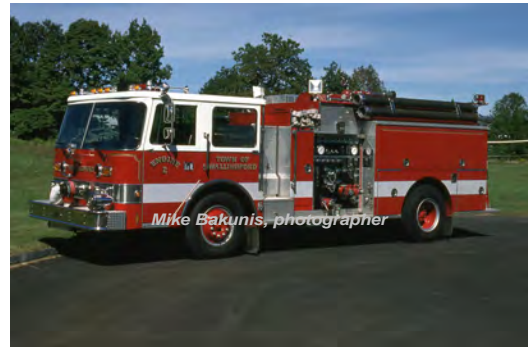
1987 Pierce Mfg. Inc. Arrow

Modified from 1973 ALF 1000 See separate record