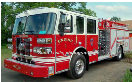
2014 Sutphen Monarch