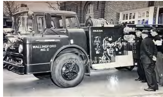
1962 American LaFrance