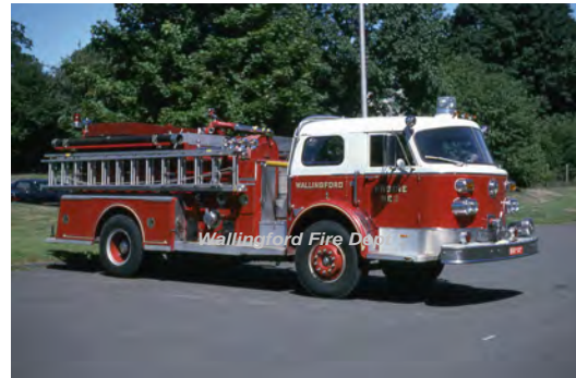
1973 American LaFrance 1000 Series