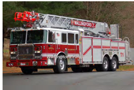
2010 Seagrave Corp. Marauder II

no pump no tank rear-mount - 100' Seagrave