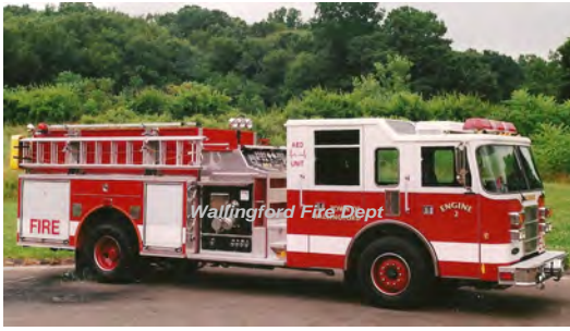
2000 Pierce Mfg. Inc. Dash