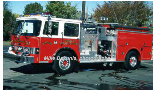
1985 Pierce Mfg. Inc. Arrow

ARN 9-1985 says this went to E7 when new 1985 Pierce went to E1. But, Photo shows it at E8, too.