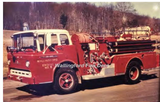
1962 American LaFrance

Delivered 12-1973 - ARN ARN 7-1977 says 100' Modified to 1987 Pierce Dash See separate record