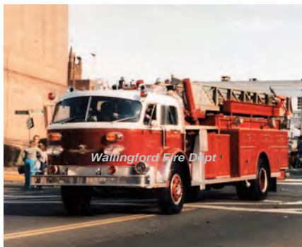
1973 American LaFrance 1000 Series