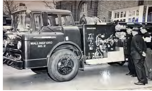
1962 American LaFrance