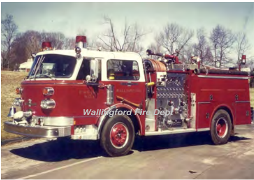
1977 American LaFrance Century Series