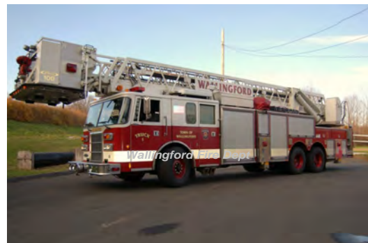
1995 Pierce Mfg. Inc. Lance

no pump no tank rear-mount - 100' Pierce