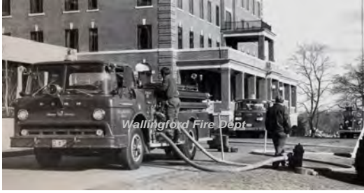
1960 American LaFrance 900 Series