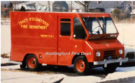
1968 Dept. Built