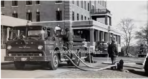
1960 American LaFrance 900 Series