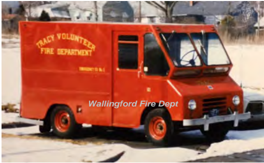
1968 Dept. Built