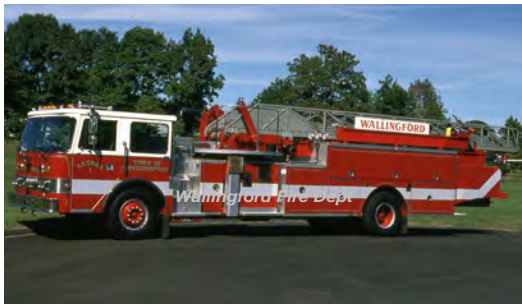
1987 Pierce Mfg. Inc. Arrow