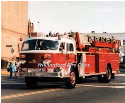
1973 American LaFrance 1000 Series