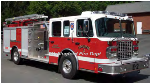
2009 Crimson Fire