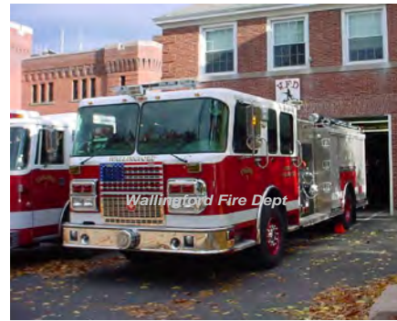
2005 Crimson Fire