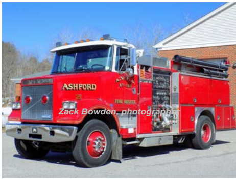
1989 American Eagle Fire App.