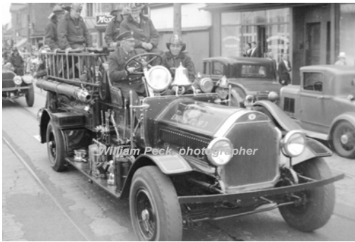
1917 Seagrave Corp.