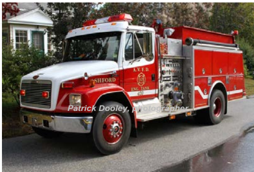
2000 Kovatch Mobile Equipment