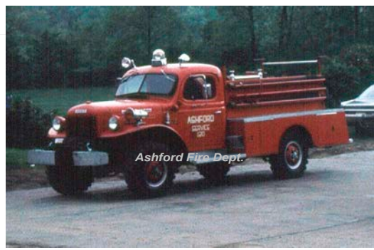
1958 Dept. Built

HC 3-23-1955 says a 1955 ALF was delivered in March of 1955 - 500 gal and hi pressure.