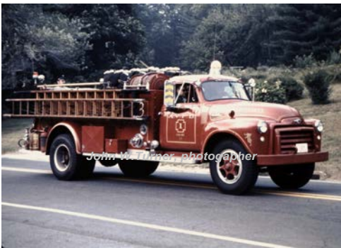
1955 American LaFrance

1956-1965 Ashford Fire Dept. Unknown use