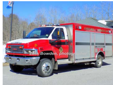
2006 Locally built