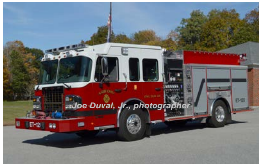
2015 Spartan ERV

was R-520 (ambulance). Put new body on it.