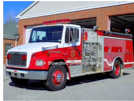
1992 Kovatch Mobile Equipment