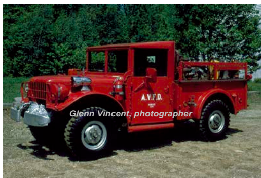
1962 Dept. Built

1976-1987 Ashford Fire Dept. S-120, F-120 Non-fire use Service, Forestry