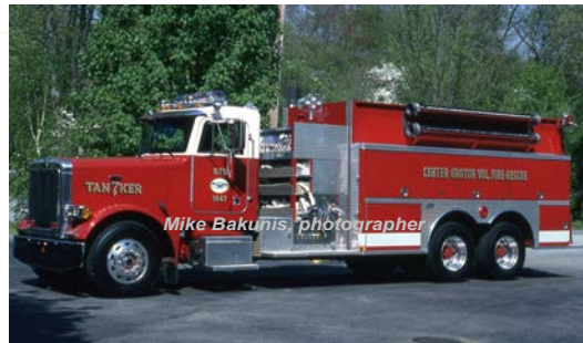
1990 Marion Body Works