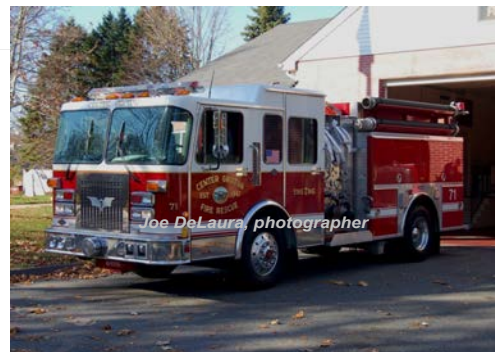
1995 Marion Body Works