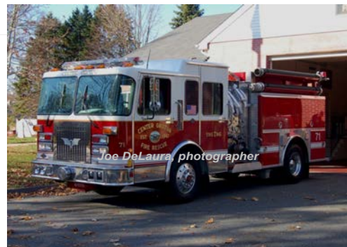
1995 Marion Body Works