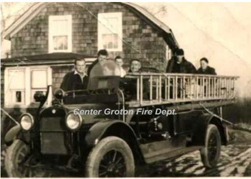
1925 Reo Motor Car Co.