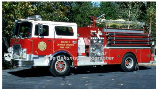
1970 Mack Trucks CF Series