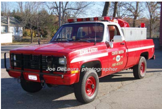
1984 Dept. Built

reg (MP7010 FDNY) ex-E162 Refurbed by Worldwide Fire App.