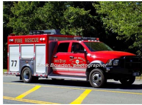
2014 Marion Body Works