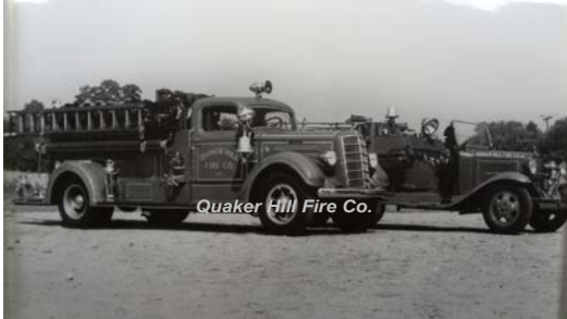
1933 unknown body manufacturer

wrecked in rollover 2-12-1954. 2nd article says $3000 damage. Photos in The Day, Dept. got the pump in about 1951 from a Gales Ferry truck that burned after a fire at firehouse in 1948. KB Series was 1947-1949