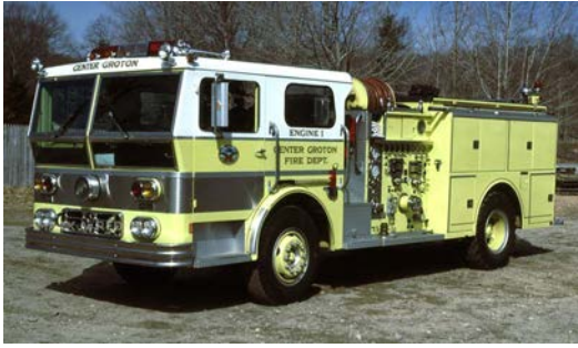
1974 Ward LaFrance Truck Corp.