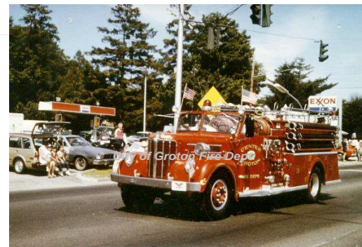
1956 Maxim Motor Co.

news photo says a WLF, replacing a 1943 ('41) and giving the co 2 pumps for 1st ... ARN says a Seagrave, and there are several other examples around the state.