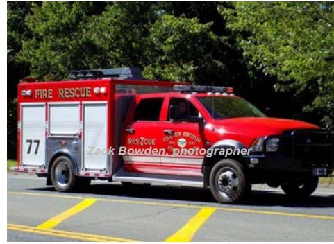
2014 Marion Body Works