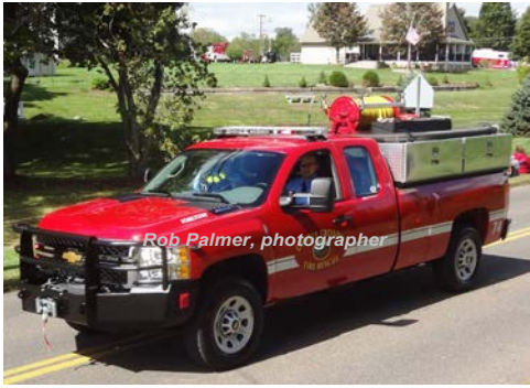
2012 Locally built