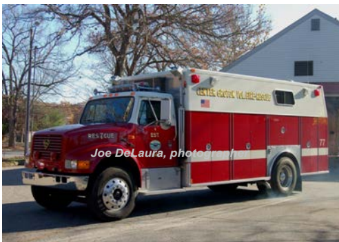
1990 Marion Body Works