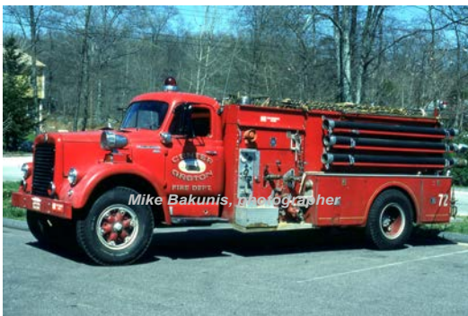
1962 Seagrave Corp.

Went to Center Groton FD after their truck was wrecked on 2-13-1954. Members spent time outfitting this rig. Photo in The Day shows tank in place of chemical tanks. NL Day says truck is a '23.