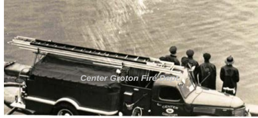
1948 Dept. Built

My guess on year. Chief said this was CG's 1st truck. Very much like PBF's truck..based year on that. Likely gone before 1954.