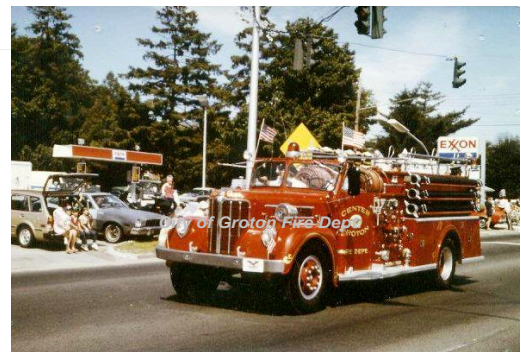
1956 Maxim Motor Co.

news photo says a WLF, replacing a 1943 ('41) and giving the co 2 pumps for 1st ... ARN says a Seagrave, and there are several other examples around the state.