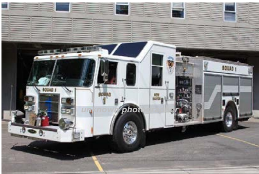
2006 Pierce Mfg. Inc. Lance