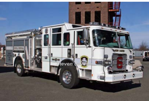
2016 Pierce Mfg. Inc. Arrow XT