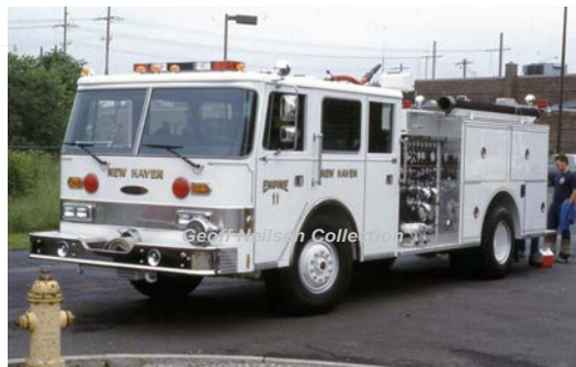
1989 Pierce Mfg. Inc. Arrow