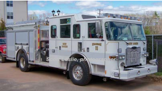
2014 Pierce Mfg. Inc. Arrow XT