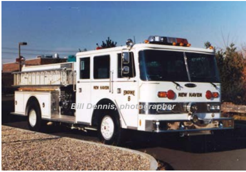
1988 Pierce Mfg. Inc. Arrow