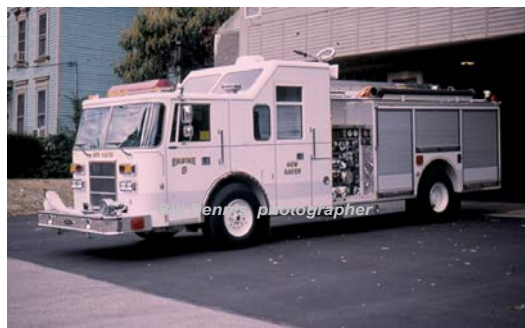
1995 Pierce Mfg. Inc. Dash