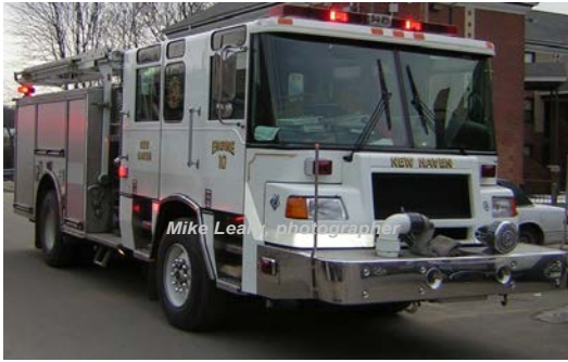
2003 Pierce Mfg. Inc. Quantum