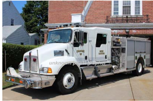
2005 Pierce Mfg. Inc.