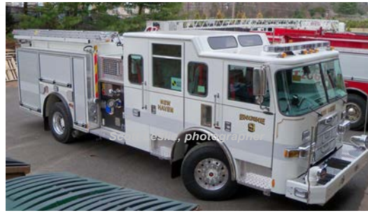
2014 Pierce Mfg. Inc. Arrow XT