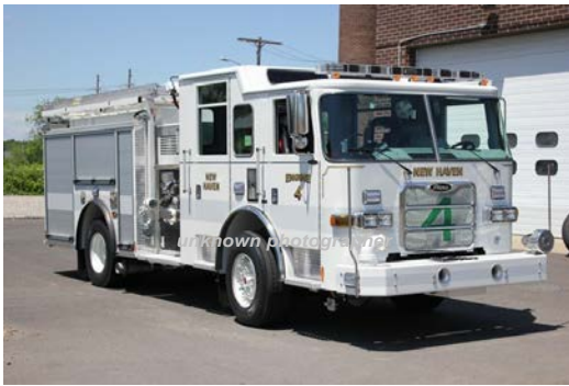
2012 Pierce Mfg. Inc. Arrow XT