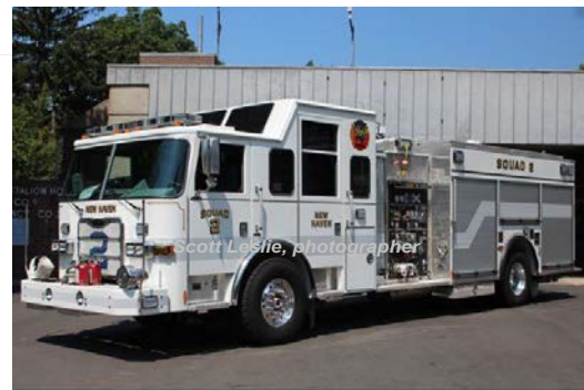
2011 Pierce Mfg. Inc. Arrow XT