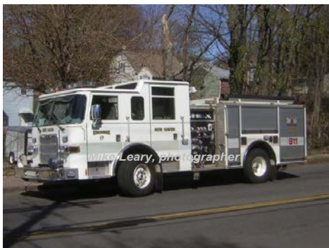
2007 Pierce Mfg. Inc. Arrow XT