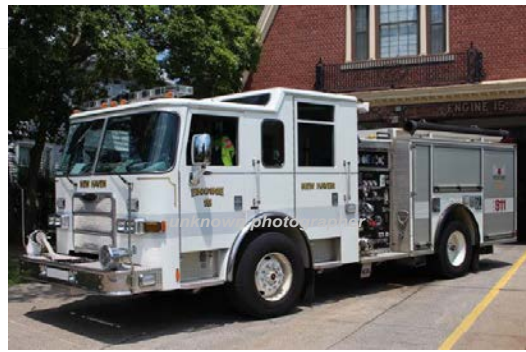
2007 Pierce Mfg. Inc. Arrow XT