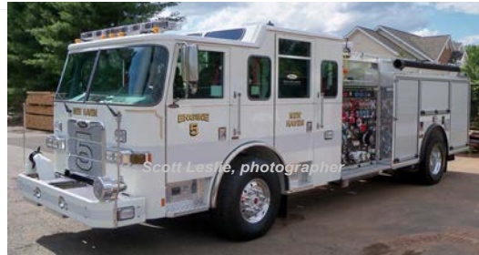
2014 Pierce Mfg. Inc. Arrow XT