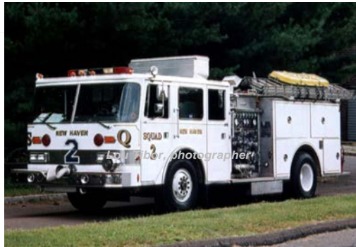
1989 Pierce Mfg. Inc. Arrow