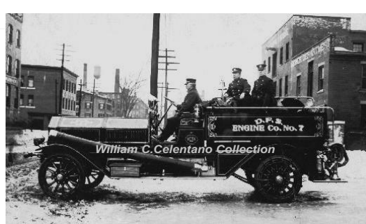
1913 Seagrave Corp.

In service 4-22-1912. Reassigned when Morris Cove was annexed. Westville incorporated on 7-15-1921 AR 1922 p.258 describes a 1912 Webb. The previous year says it's 500 gpm. Neither say both. Is it the same Webb that NHFD had? Says