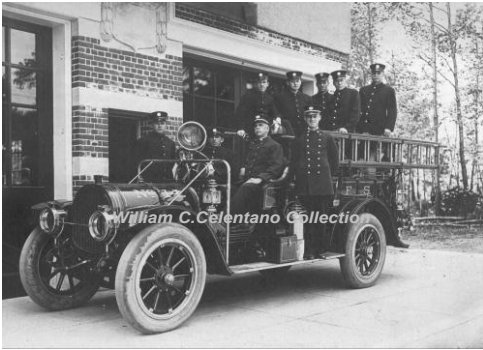
1911 Pope Mfg. Co.