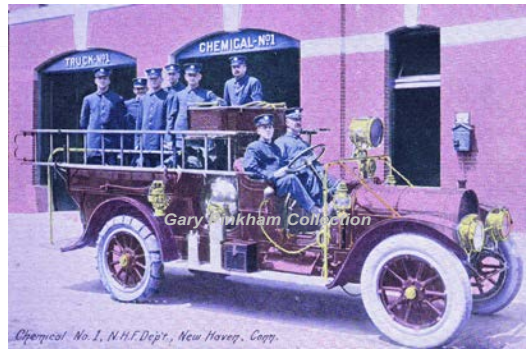
1911 Pope Mfg. Co.