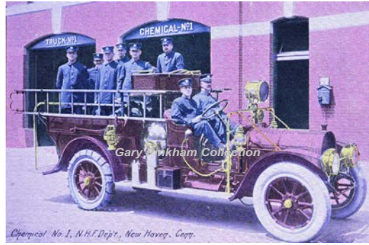
1911 Pope Mfg. Co.