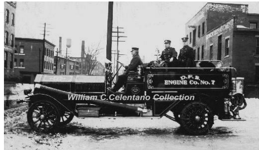
1913 Seagrave Corp.

In service 4-22-1912. Reassigned when Morris Cove was annexed. Westville incorporated on 7-15-1921 AR 1922 p.258 describes a 1912 Webb. The previous year says it's 500 gpm. Neither say both. Is it the same Webb that NHFD had? Says