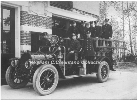
1911 Pope Mfg. Co.