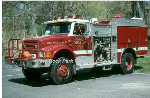
2002 Pierce Mfg. Inc.