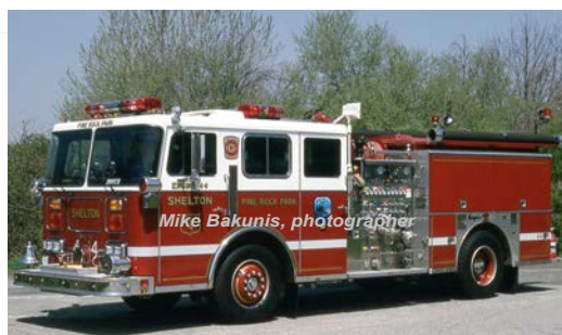
1990 Seagrave Corp.