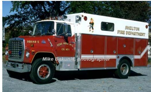
1985 SuperVac (SVI)

2004- Pine Rock Park Fire Co., Shelton Eng 42