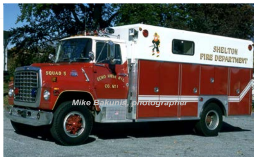
1985 SuperVac (SVI)

2004- Pine Rock Park Fire Co., Shelton Eng 42