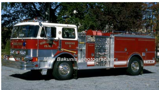
1976 Hahn Motors