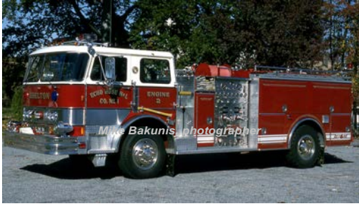
1976 Hahn Motors