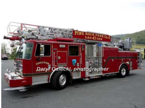
2014 Kovatch Mobile Equipment