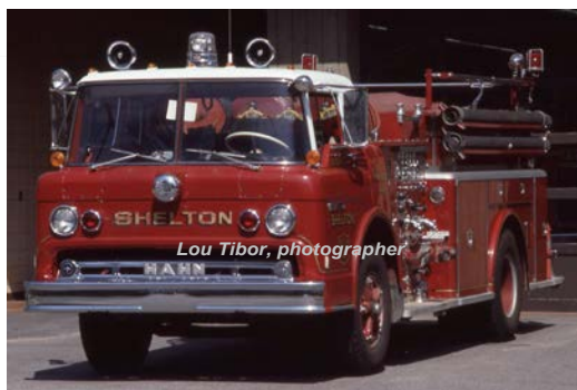
1970 Hahn Motors