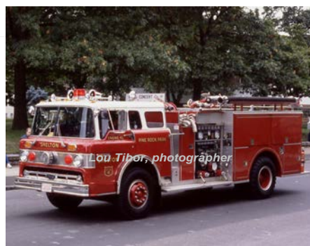
1984 Pierce Mfg. Inc.