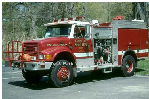
2002 Pierce Mfg. Inc.