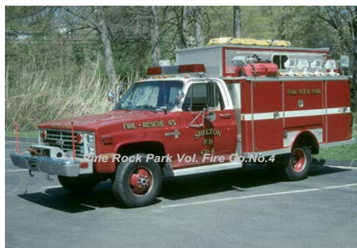
1985 E-One, Inc.