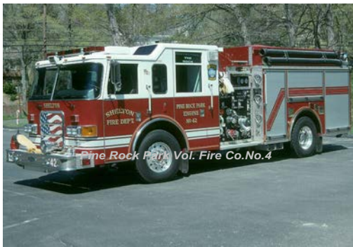
2004 Pierce Mfg. Inc. Enforcer

2002- Pine Rock Park Fire Co., Shelton Eng 43