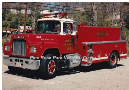
1980 Truck Power Equipment

In 1972 the company purchased a utility truck that was made into a rescue truck In 1975,