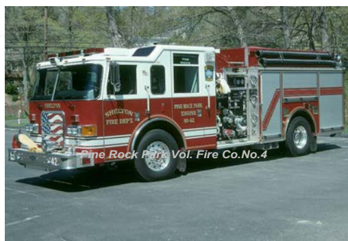
2004 Pierce Mfg. Inc. Enforcer

2002- Pine Rock Park Fire Co., Shelton Eng 43