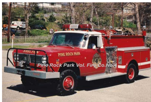
Pine Rock Park Vol. Fire Co.No.4

1970s-unk Pine Rock Park Fire Co., Shelton