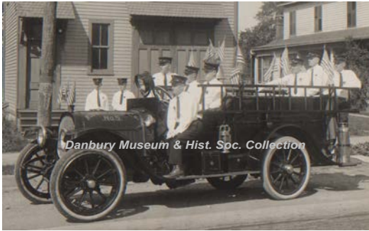
1919 Pope Mfg. Co. Pope Mfg. Co