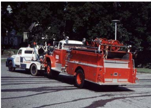
1965 American Fire Apparatus Dodge

$12500 No chrome. Tell Wooster what happened to this truck if N Branford knows. Wooster voted to sell truck to N Branford 9-16-1964. $1000. Taken as of 11-3-1964. Truck from Mill Plain will be used until new truck arrives.