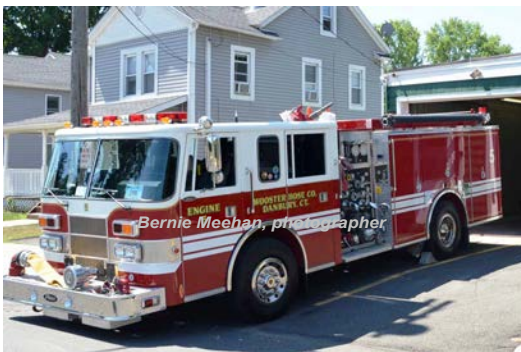
1996 Pierce Mfg. Inc. Saber

1st diesel in Danbury AMB 1500-DD-5 Shipped 10-28-1975 Wrecked in accident