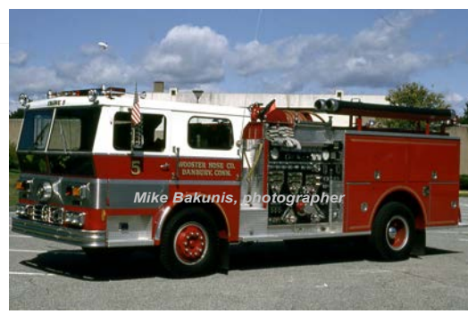
1975 Ward LaFrance Truck Corp. Ward LaFrance

2 hi-pressure lines. 4-stage pump. In service 3-1965.