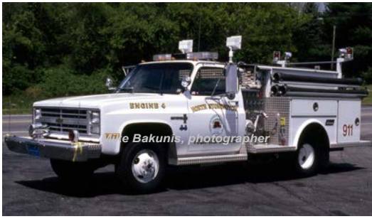
1985 Saulsbury Fire Equip.