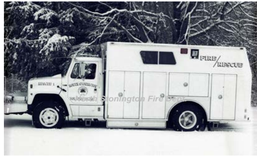
1987 Marion Body Works