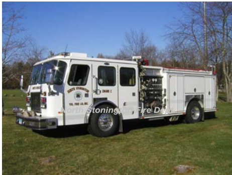
1995 E-One, Inc. Cyclone II