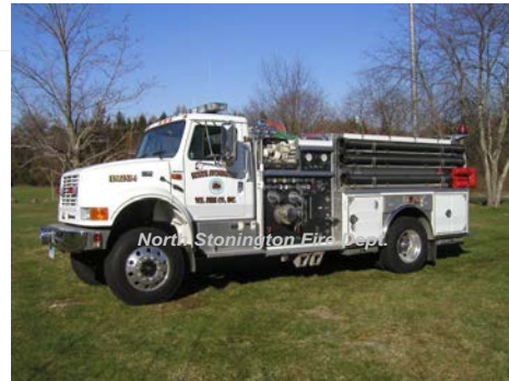
2001 Ferrara Fire App.