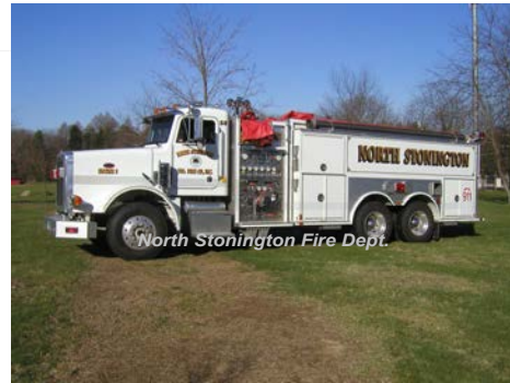
1993 Allegheny Fire Equip.