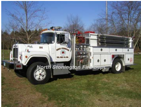
1990 E-One, Inc.