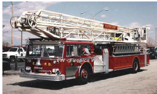
1965 Ward LaFrance Truck Corp.

no pump no tank rear-mount - 75' Mobile Aerial Towers Hi-