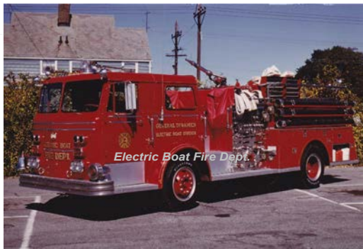
1964 Maxim Motor Co. F-Model