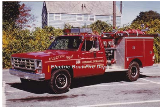
1979 Pierce Mfg. Inc.

Reg #6189 ship 10-26-1927 112 PWT. Not used, but restored by Andover. Gave this back to Fire School about 2008 and is in cafeteria.