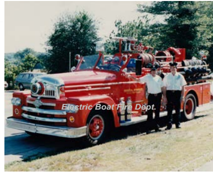
1959 Seagrave Corp. 70th Anniversary