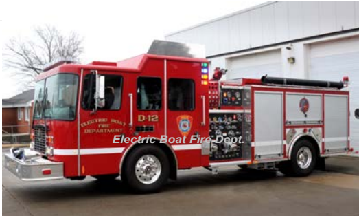
2013 Ferrara Fire App.