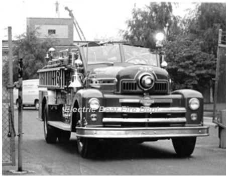
1955 Seagrave Corp. 70th Anniversary