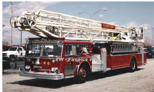
1965 Ward LaFrance Truck Corp.

no pump no tank rear-mount - 75' Mobile Aerial Towers Hi-