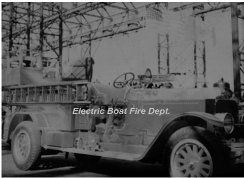
1927 American LaFrance