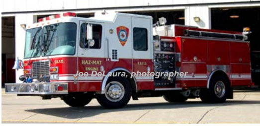
1998 Ferrara Fire App.