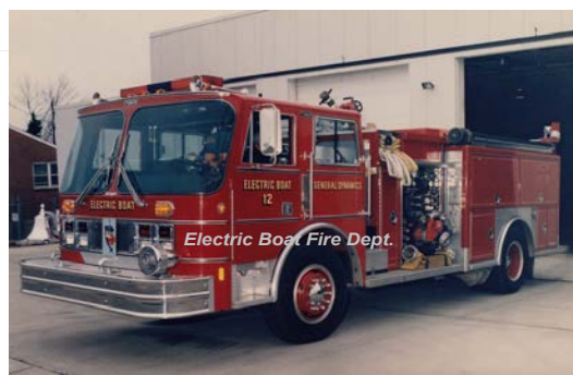
1987 Ranger Div.- American Modular