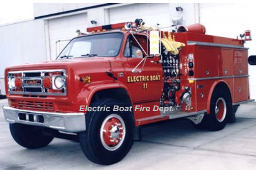
1987 Middlesex Fire Equipment