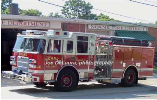
2008 Pierce Mfg. Inc. Arrow XT