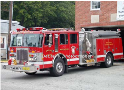
1993 R.D. Murray Co.