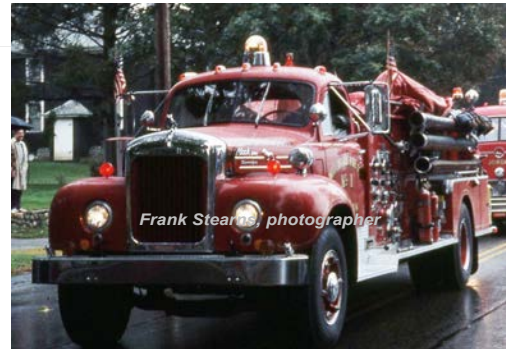
1964 Mack Trucks B Series