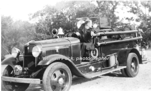
1934 Locally built