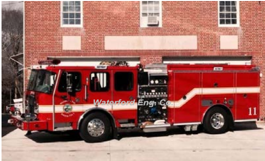
2014 E-One, Inc. Typhoon