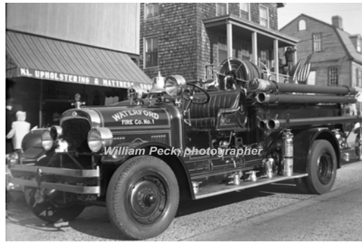
1930 Seagrave Corp.