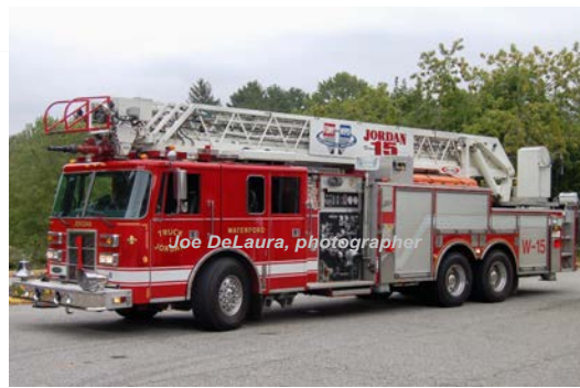
1996 Pierce Mfg. Inc. Lance

1500 gpm 300 gal rear-mount - 105' Pierce