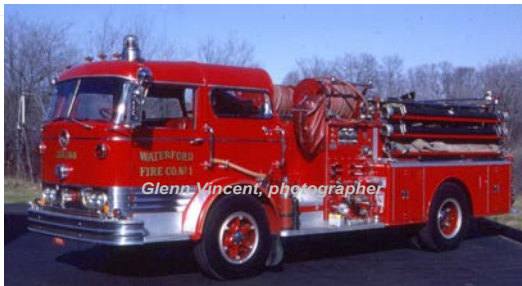
1960 Mack Trucks C Series

combination hi-pressure pumper. In 1964 photo of all Waterford apparatus