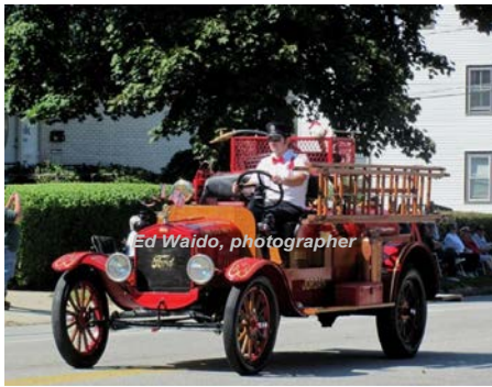
1923 American LaFrance